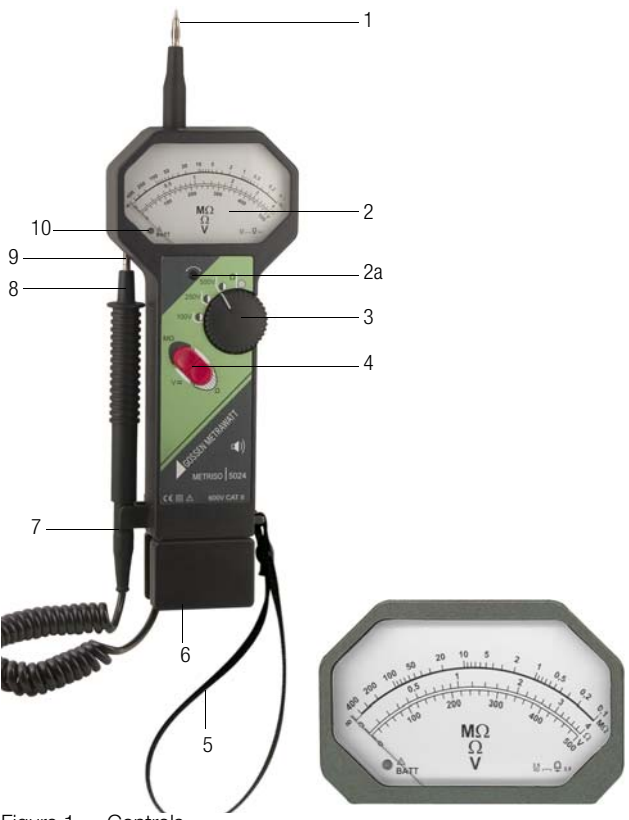
Figure 1 Controls