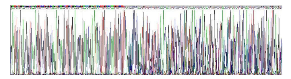
Figure 1. Gene Sequencing (Extract)