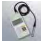
Electromagnetic Coating Thickness Tester LE-373

The LE-373 is an electromagnetic coating thickness tester for measuring the thickness of coatings such as paint or plating (except electro nickel coating) on magnetic substrates. It can transmit data to a printer or computer, and includes 16 different functions such as application (calibration curve) memory, measurement data memory, upper and lower limit setting for coating thickness management, simple statistical processing, and data output.