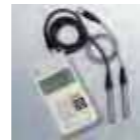
Dual-Type Coating Thickness Tester LZ-373

The LH-373 is a coating thickness tester for measuring the thickness of insulating coatings on non-magnetic metal substrates. It is capable of measuring relatively thin coatings such as alumite with high accuracy. As with the LE-373, there are added functions to output data to a printer or computer, and carry out simple statistical processing including times measured, average, maximum and minimum values, and standard deviation.