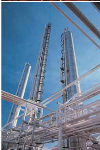
The 373 series can be expected to be useful in many workplaces where coating thickness management is required.