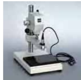
Optional measurement stand LW-990

[McWAVE is the registered trademark of CEC Co. Excel is a trademark and registered trademark of the Microsoft Corporation in the USA and other countries.]