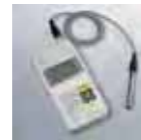
Eddy Current Coating Thickness Tester LH-373

The LE-373 is an electromagnetic coating thickness tester for measuring the thickness of coatings such as paint or plating (except electro nickel coating) on magnetic substrates. It can transmit data to a printer or computer, and includes 16 different functions such as application (calibration curve) memory, measurement data memory, upper and lower limit setting for coating thickness management, simple statistical processing, and data output.