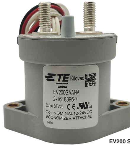
EV200 Series Contactor (CZONKA Relay, Type