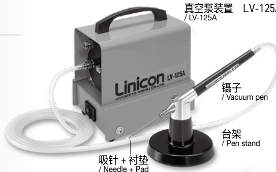
真空泵装置 LV-125A / LV-125A

适用于移动 IC 和 LSI 等电子部件。也适用于手表等精密微型零件、化学品和其他小零件。 / Most suitable for handling electronic parts such as ICs and LSIs. Also precise micro parts such as watches, chemicals and other small parts.