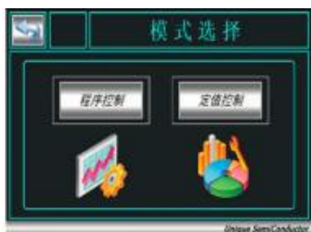
Display the interface

damage caused to the test product and test box due to failure